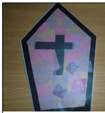
Francesca, Y1 Advent stained glass window