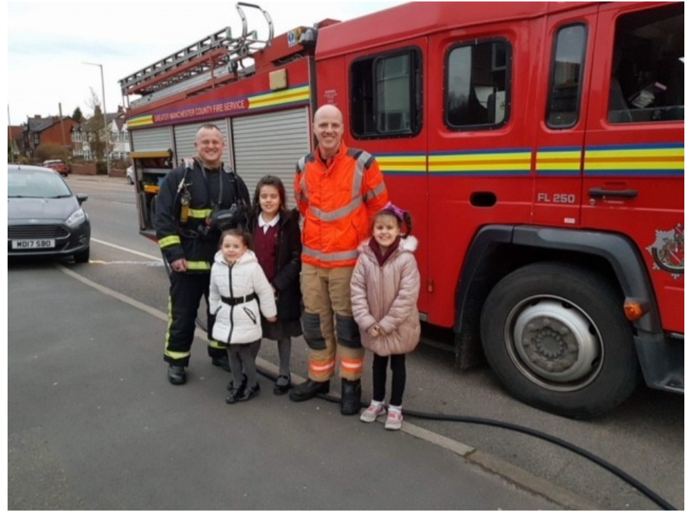
Sacred Heart sisters save grandma from burning car!

The more tokens we get, the more money we earn....possibly up to £4000.